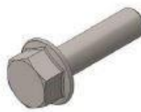
M10x25 FLANGE BOLT 12x