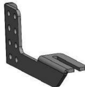
DRIVER SIDE FRONT-CENTER-REAR BRACKET-2 3 x QTY