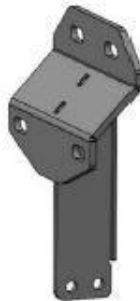
PASSENGER SIDE FRONT-CENTER-REAR BRACKET-1 3 x QTY