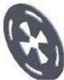
HTC 271 M8 CLIPS 18x