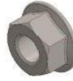
M10 FLANGE NUT 12x