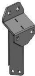
DRIVER SIDE FRONT-CENTER-REAR BRACKET-1 3 x QTY