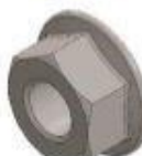
M8 FLANGE NUT 18x